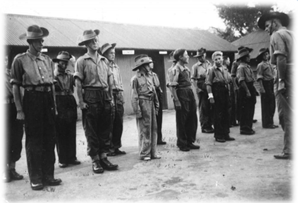
Bunbury High School: Cadet Parade Swanbourne 1950

The hall was now too small for socials so dances had to be split into lower and upper school dances.